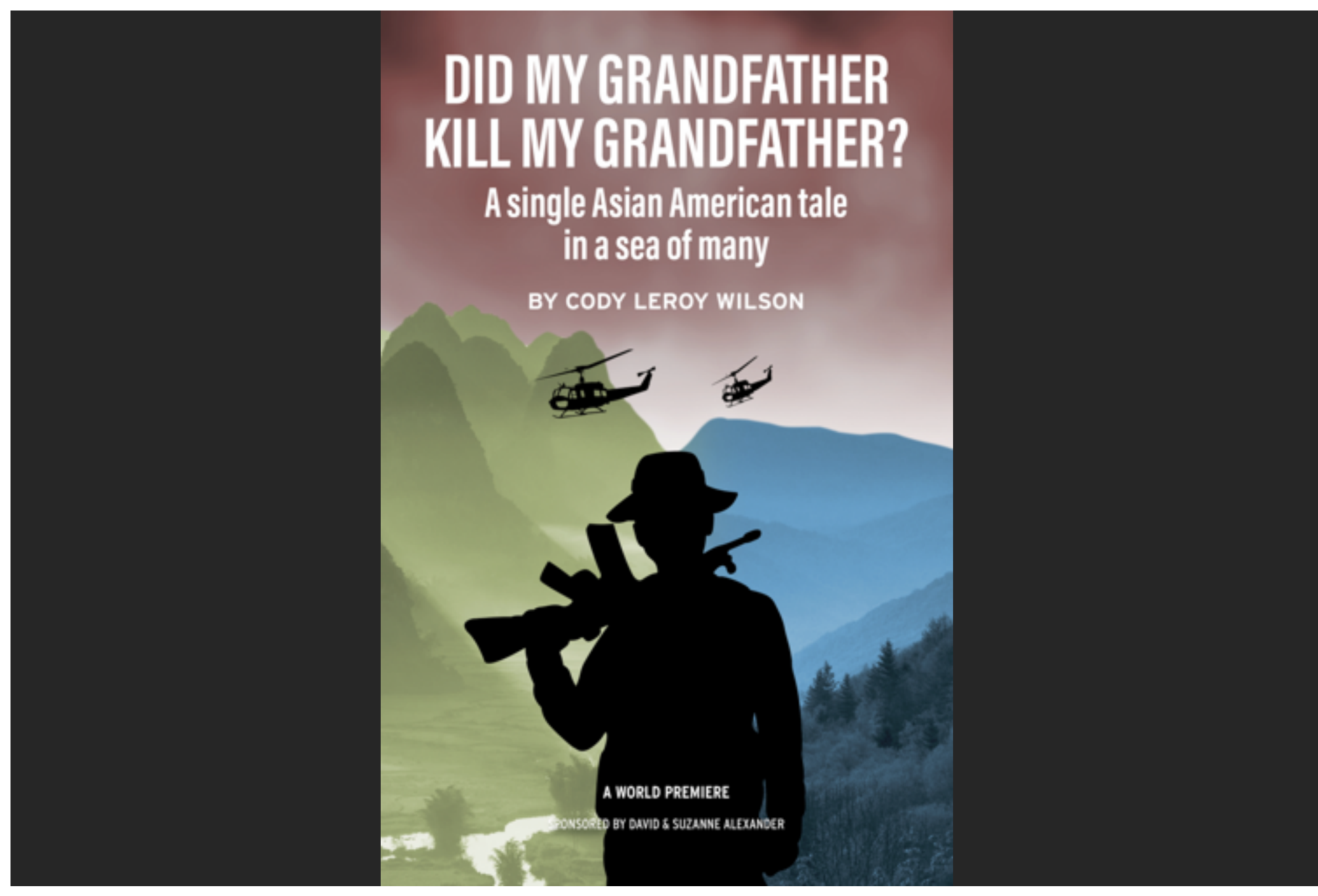
"Did My Grandfather Kill My Grandfather?" will be premiered at the Contemporary American Theater Festival next month.